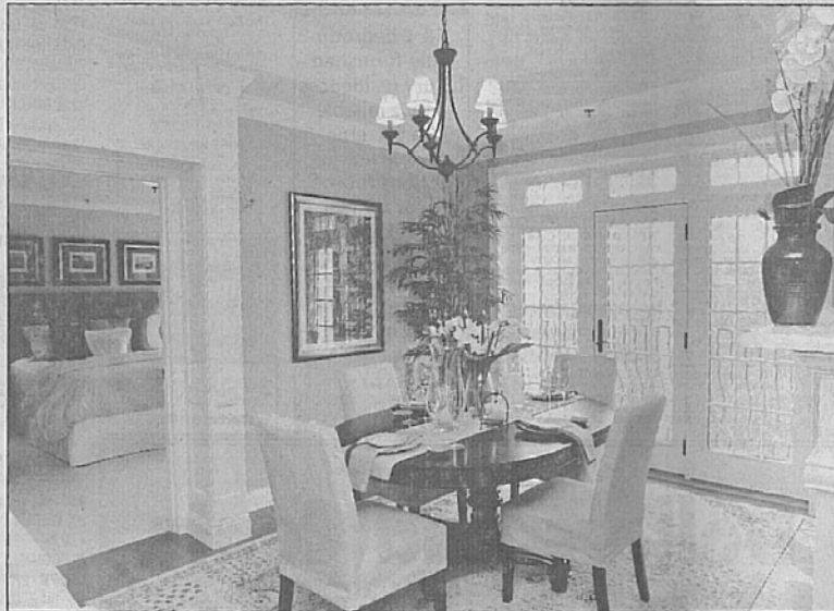
The dining area, above, looking into the master bedroom; below, a living room/dining area at a condo in the East Greenwich complex.

The auction information center and model homes are open to preview daily through April 16 at 1404 South County Trail. Until the auction, they will be open Wednesday and